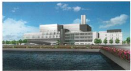
▲Eco Clean Pier Harima

Contacts for inquiries regarding garbage are also going to change.